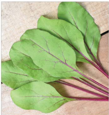
EARLY WONDER TALL TOP