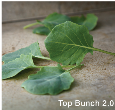
Top Bunch 2.0