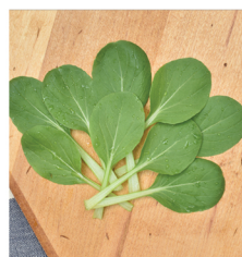
FENG QING CHOI