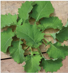
IMPROVED DWARF SIBERIAN