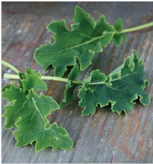
VATES BLUE CURLED SCOTCH