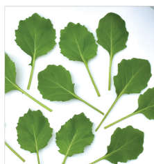
TOP BUNCH 2.0