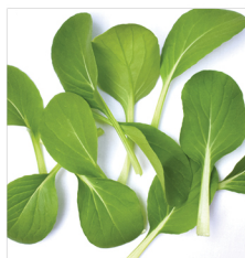
MEI QING CHOI