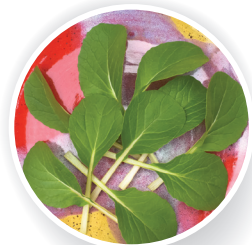
JOI CHOI PAK CHOI