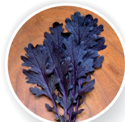
MIZ AMERICA MUSTARD