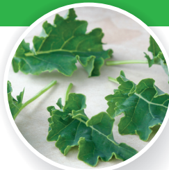
BLUE RIDGE KALE