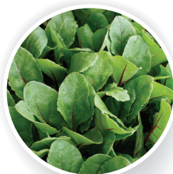
RUBY FRESH SWISS CHARD