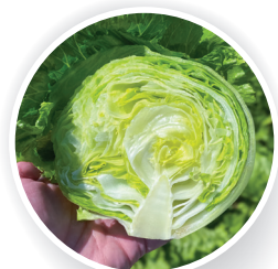
PINT SIZE LETTUCE