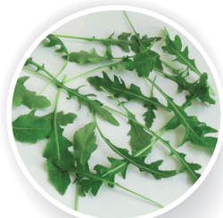
GREEN ARROW WILD ROCKET