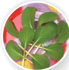
JOI CHOI PAK CHOI