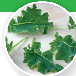
BLUE RIDGE KALE