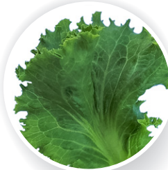
CIELO VERDE LETTUCE