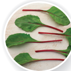
FIRE FRESH SWISS CHARD