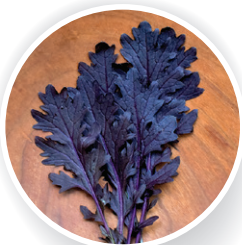
MIZ AMERICA MUSTARD