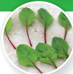
FRESH START BEET