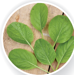
SAVANNA SPINACH MUSTARD