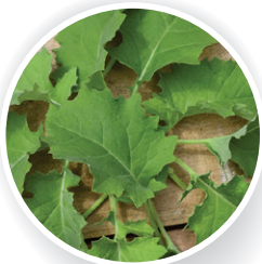
IMPROVED DWARF SIBERIAN KALE